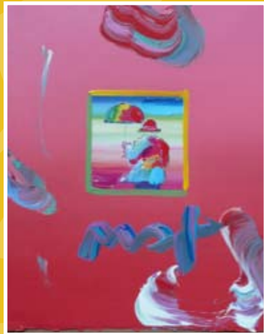
Peter Max Untitled Acrylic on Paper Unique Version #295367