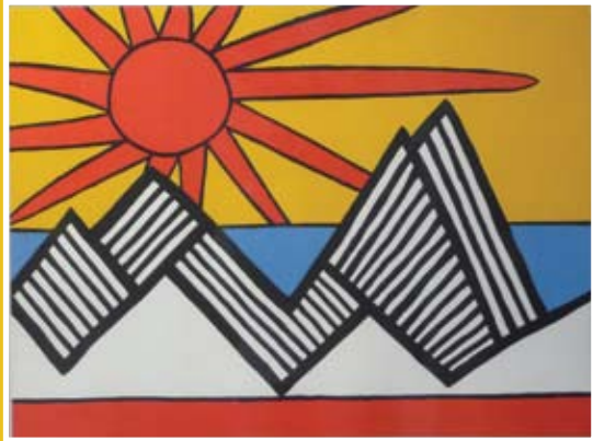
Alexander Calder Le Soleil (The Sun) Hand signed original color lithograph